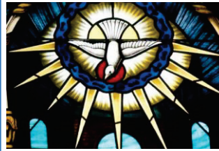
A representation of the Holy Spirit in St. Louis, King of France, in downtown St. Paul shows a dove emanating nine rays representing the nine fruits.